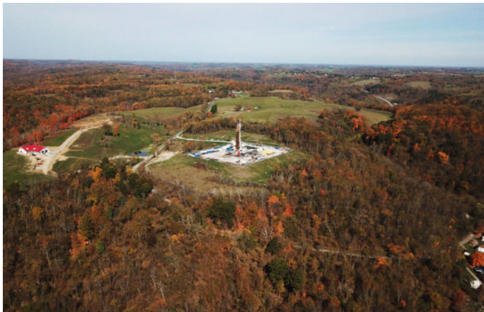
Well pad in Jefferson County, OH.

Amount of Lost Revenue: Wasted gas resulted in the following lost potential volume and value by source: