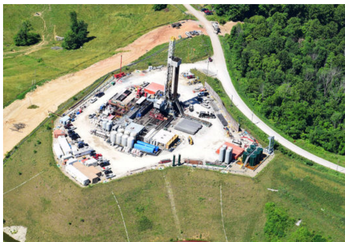
Well pad in Monroe County, OH.

In 2019, fossil fuel producers wasted 31 billion cubic feet of gas in total: 99.6% by leaking and 0.4% by flaring and venting.